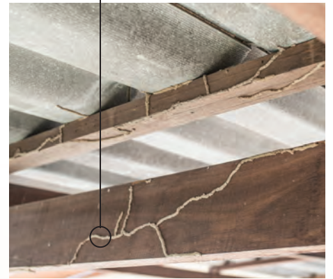
Termite damage to wood